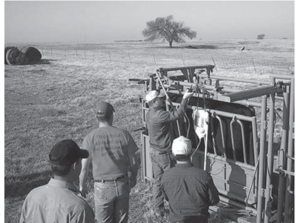
Senior design students work on the W-W cattle chute.