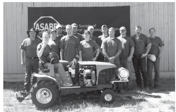
The Cowboy Motorsports team at the ASABE 1/4-scale tractor competition.

The 2007 1/4-scale tractor competition marks the 10th anniversary of the event and will be held May 31-June 3 at the Expo Gardens in Peoria, Ill.